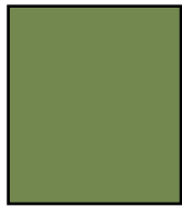
Bleed page 8.5 x 11 in Trim Size 8.25 x 10.75 in