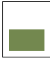
½ page hor. 7.208 x 4.75 in

Live area of bleed page ads is (7.875 x 10.373 in).